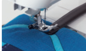
Thick handle can be sewn with ease. 3-12-3 layers of denim.