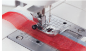
No fabric shrinkage even sewing on extra light weight materials.